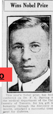
Wins Nobel Prize

This year's Nobel prize, has been conferred on Dr. F. G. Banting of the medical department of the University of Toronto, for his gift to humanity through the discovery of insulin, adjuvant a successful treatment for diabetes.